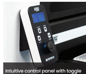
Intuitive control panel with toggle