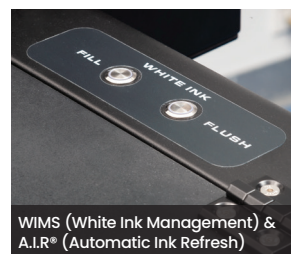
WIMS (White Ink Management) & A.I.R.® (Automatic Ink Refresh)