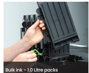
Bulk ink - 1.0 Litre packs