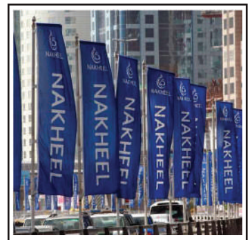
Flags & Banners