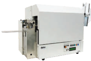
Rotary Cutter(with / without)