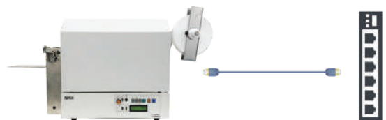
Enables LAN connection